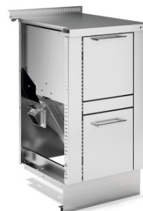
PELLET TANK Additional tank pellet (can only be installed on the right)