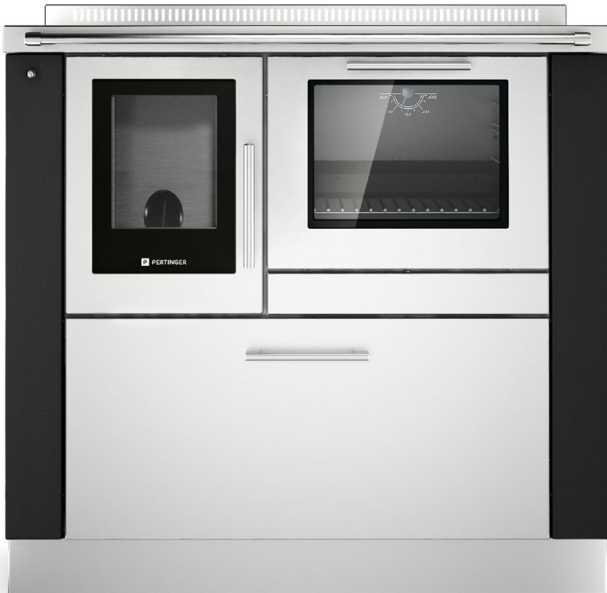
PANORAMA Black F5 / Stainless steel