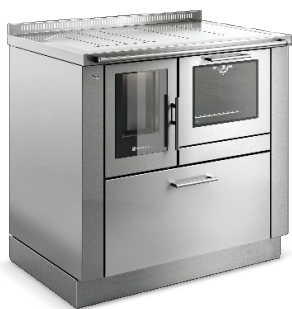
PANORAMA Stainless steel