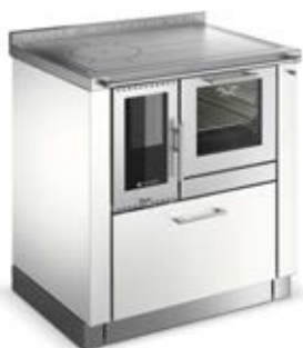
PANORAMA White F8