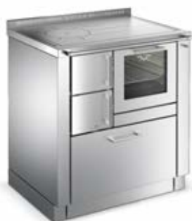
TREND Stainless steel